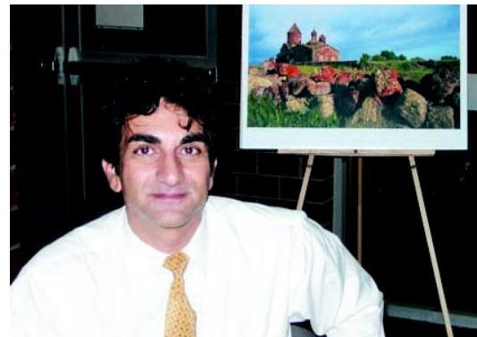
The Co-author of "The Stone Garden Guide to Armenia and Karabagh" during a book signing event at California State University, Fresno.

This book is highly recommended for any traveler to Armenia. It is a publication that makes the reader aware of the wonders of an ancient land. To read this book is to guarantee a trip to Armenia and Karabagh.